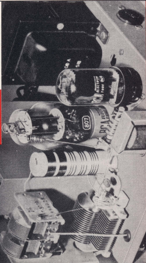
Close-up view of the RCA-807 final amplifier in the S-255.